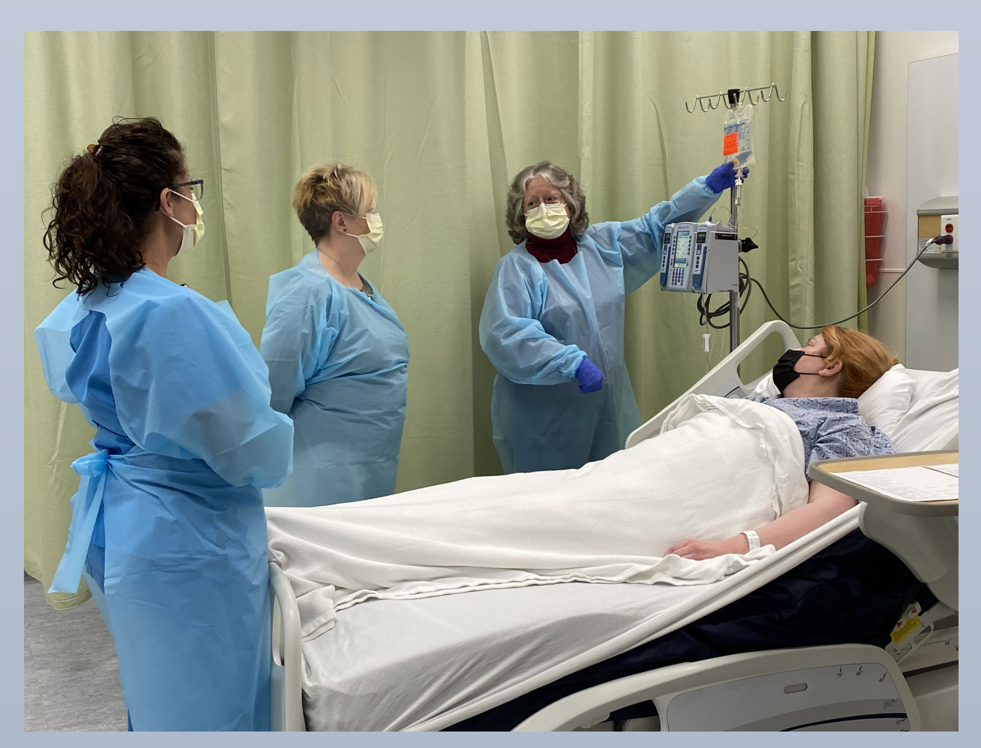
Hypersensitivity reaction with Standard Patient